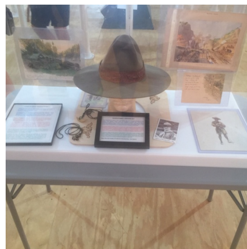
Baden Powell's Hat