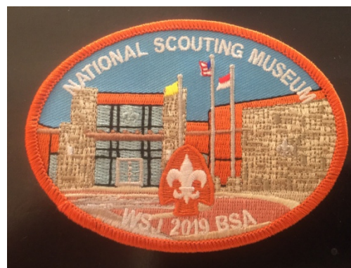
The Museums Official patch

The following are just a few pictures of the interior of the museum.