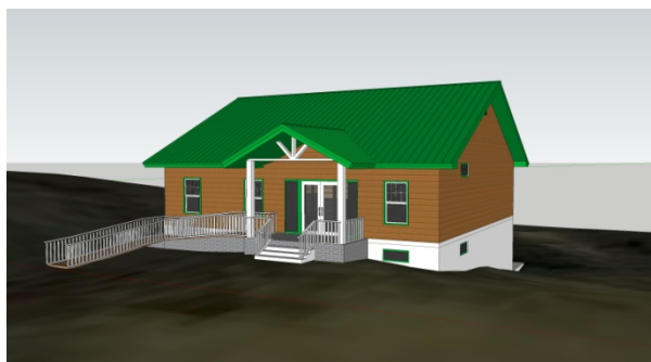
Front Entrance View

If this story triggers any more questions please let me know.