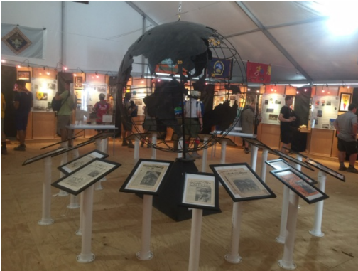
The beautiful central display had a stylized globe of the world