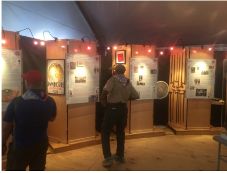
A few of the 24 display cases one for each WSJ that went around the room on the outside wall