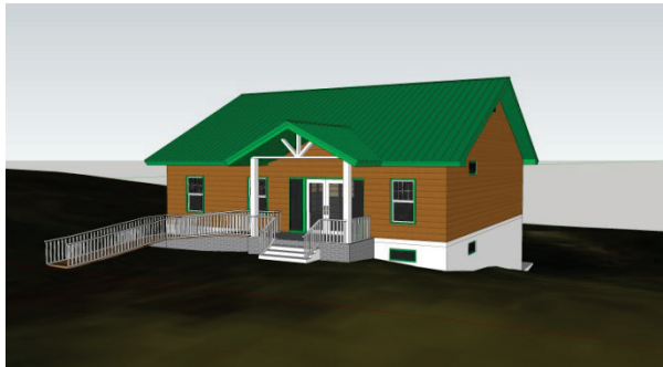
Front Entrance View

Shown below are the new revised Artist Concept Pictures of the new NJSM Building