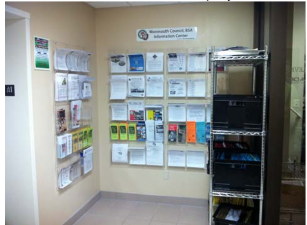
MCBSA Service Center Lobby