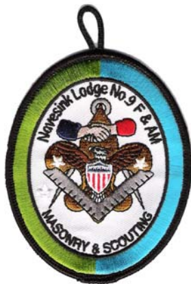
Boy Scout - Masonic Patch